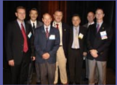
The faculty from the Damage Control Symposium at the 2006 OTA Annual Meeting.