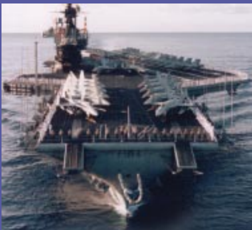
USS Midway /Member Reception

The last half hour of the session was a question and answer session which included how to stay in practice with your typical trauma patient profile, billing, and negotiating contracts. There was additional valuable input by Brad Henley on negotiations, coding and billing. The Forum was a great success, and the attendees were grateful for the OTA's support.