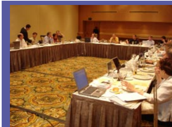
OTA Board of Directors Meeting at the 2006 Annual Meeting

The attendees were grateful to the OTA for its continued support. Attendance at this breakfast increases each year with continued participation of the female orthopaedic trauma attendings and new young women interested in a career in orthopaedic traumatology.