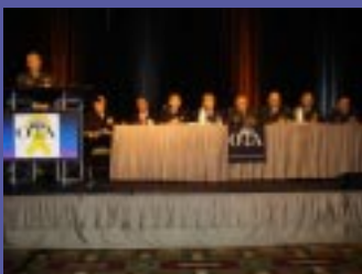
Military Medical Symposium at 2006 OTA Annual Meeting

Grant Title: Timing of Orthopaedic Surgery in the Multiply-injured Patient: Development of a Protocol for Early Appropriate Care